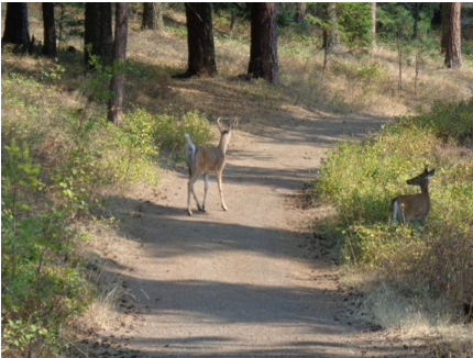
Deer strolling on Tubbs Hill.