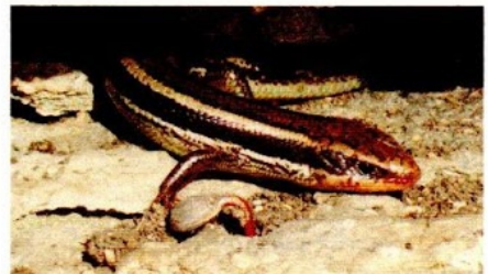
Another Tubbs Hill resident.