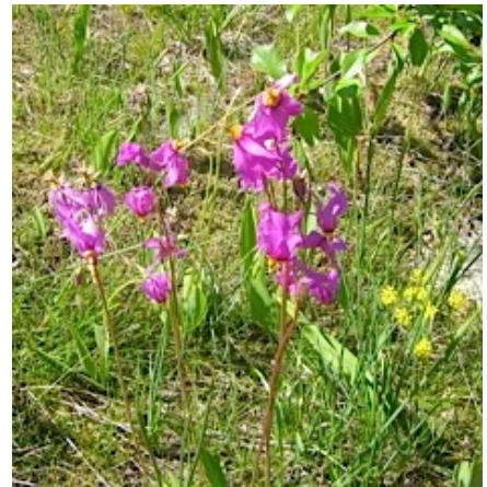
Flowers on Tubbs Hill

THANK YOU for your generous support. Your contribution to the Tubbs Hill Foundation is tax-deductible as permitted by federal law for nonprofit foundations.